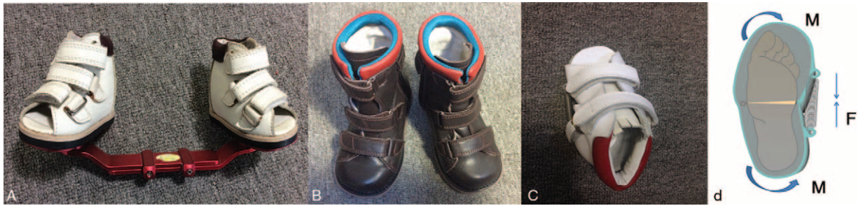
FIGURE 1. From left to right: A, Dennis Brown Splint; B, orthopedic shoe with orthopedic insole in it. There are anterior and posterior outflares on the shoes and a velcro in the malleolar area to control equinus; C, top view of forefoot abduct shoe for left foot; and D, the schematic bottom view of the forefoot abduct shoe for left foot.

Reiman 19 proposed a dynamic splint to correct adduction. An elastic cord on the splint's lateral side acts to support the cuboid and exert the necessary counter-pressure for abduction of the forefoot. However, considering its complexity and difficulty with use, the splint can only be used at night, and is thus not commonly used in clinical practice.